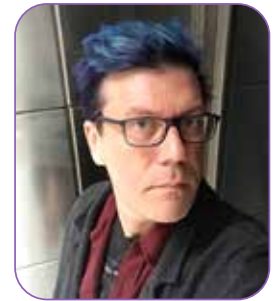
Shown: the subject next to a shiny building, wearing glasses. Other styling options and settings are available.